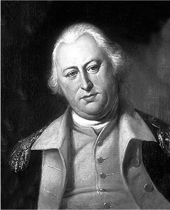
Maj. Gen. Benjamin Lincoln