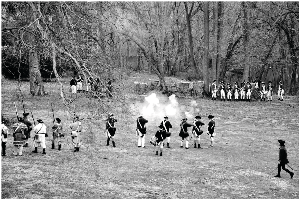
Americans fire on the British lines