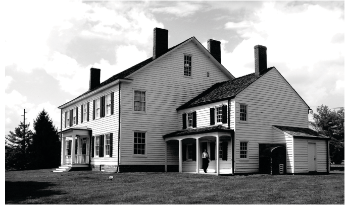
Philip Van Horne house, as it looks today